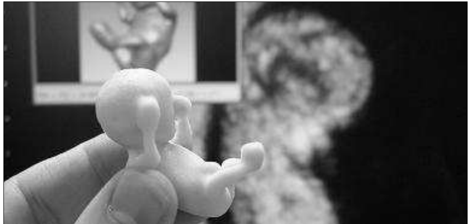
Ultrasound image and plaster model of a 12 week foetus.